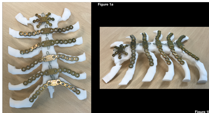
Figure 2: a: pre-operative 3-dimensional model of a complex sternal anatomy with non-union. b: peroperative result after relatively easy implantation of the fixation plates.

Figure 1: a: frontal view of a non-complex sternal mal-union, with pre-bent titanium fixation plates. b: sideview of the patient specific 3D model with appreciation of the anatomical shaping of the Synthes® titanium fixation plates.