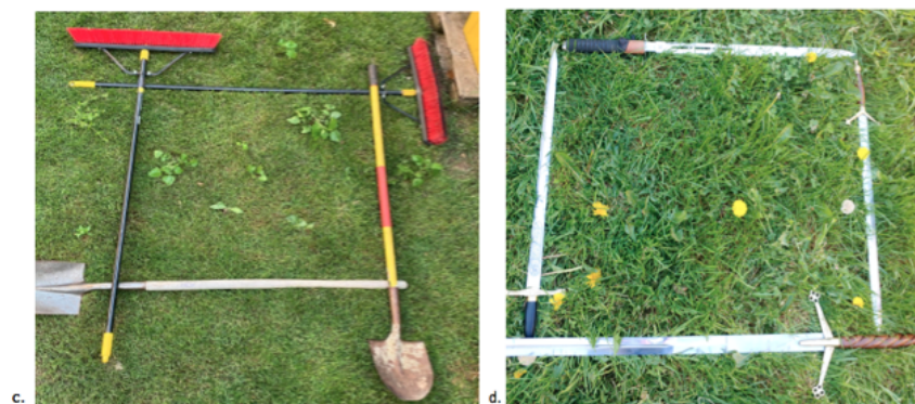
Figure 2. Examples of the student made quadrats composed of: a. burdock roots, b. measuring tapes, c. brooms and shovels, d. large swords.

Discussion board posts : Students in two joint sections of the remote ecology course ( n=31 ) generated 103 discussion-post comments. Based on the tone and word choice it's clear that the discussion posted were used as a way to support and encourage each other, and to make social connections despite current social distancing.