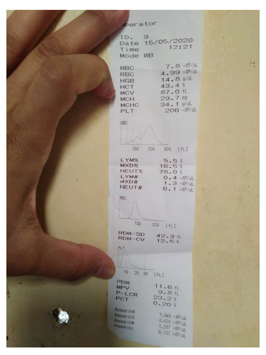
Figure 1. pre-treament CBC

8. BBC (Michelle Roberts). Coronavirus: Dexamethasone proves first life-saving drug. 2020, June 16. https://www.bbc.com/news/health-53061281.