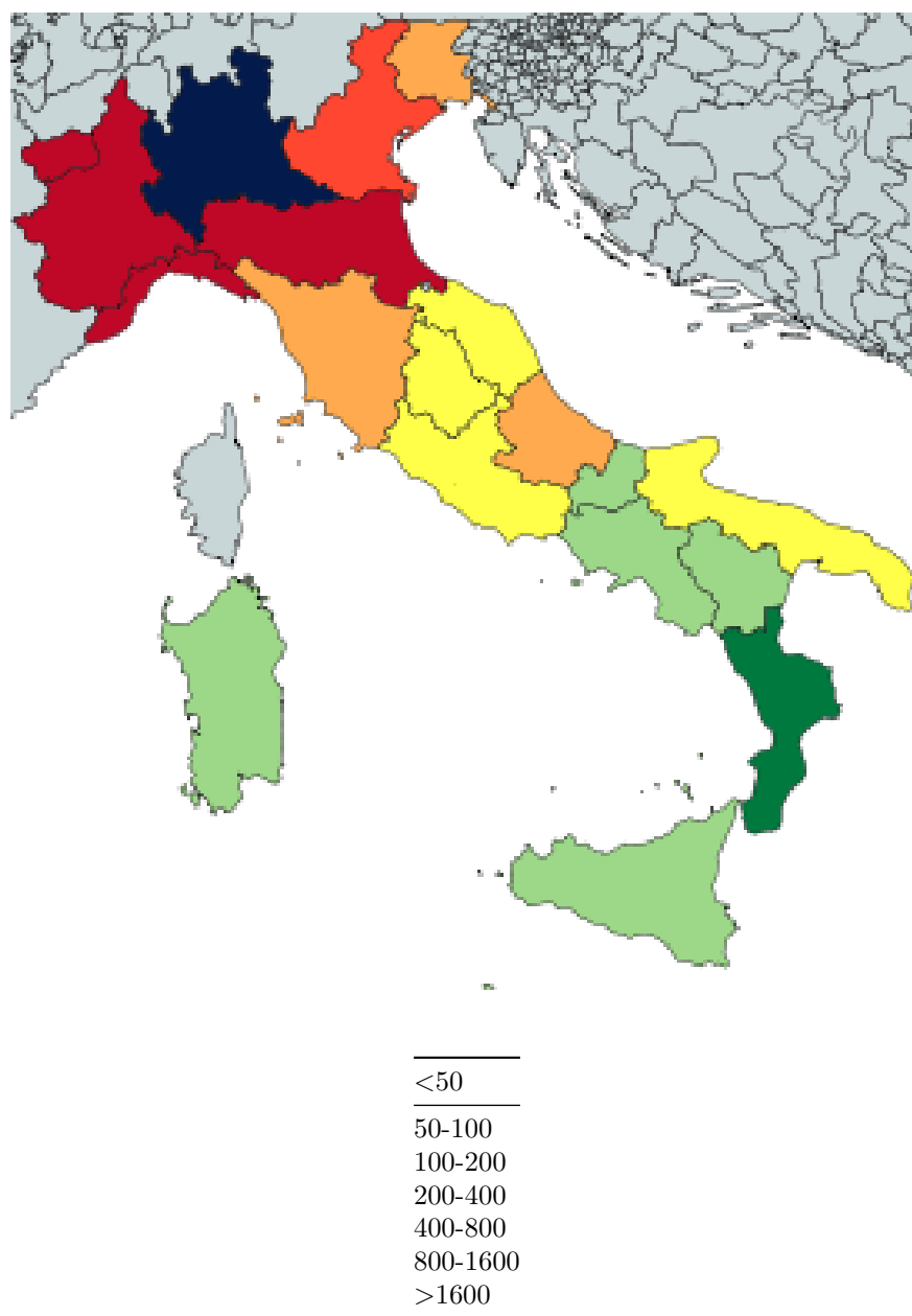
Figure 1: Differences in death rates between Italian regions (July 13, 2020)