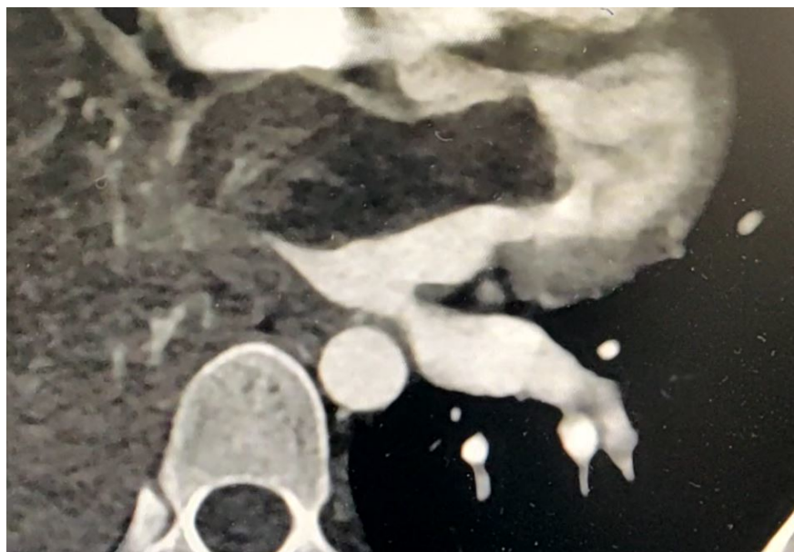
Figure 2 :CT Chest image showing right lung lower lobe mass entering the left atrium through pulmonary vein