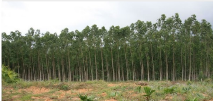
Eucalyptus Forest (EF)