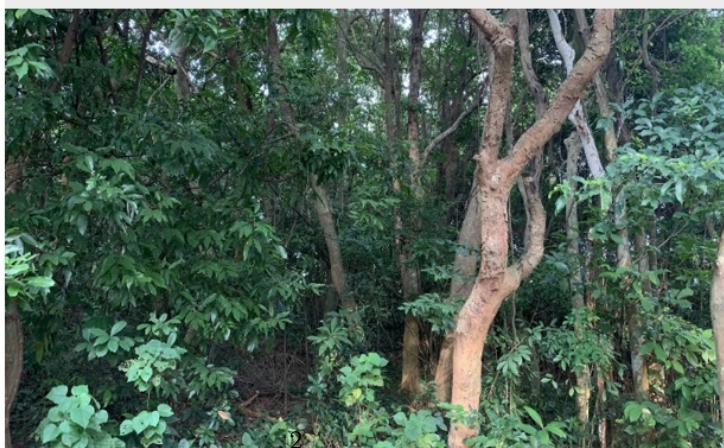
Secondary Natural Forest (SF)