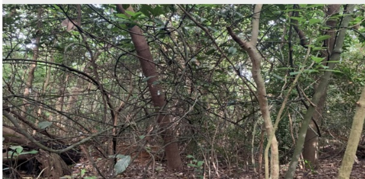
Mixed Broadleaved Forest (MF)