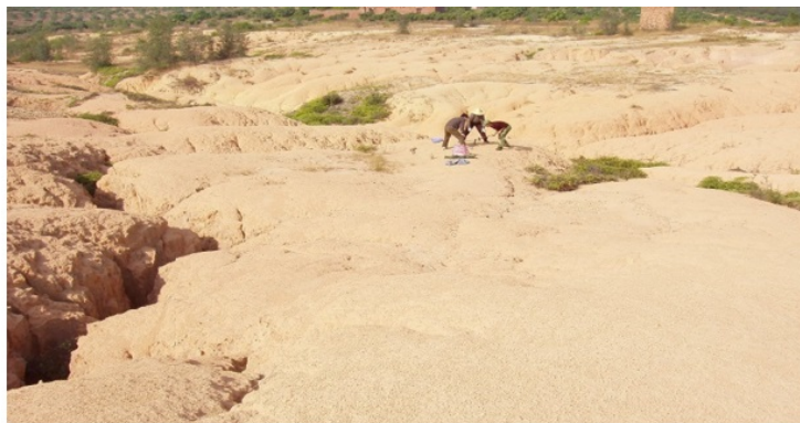
Barren Land (BL)