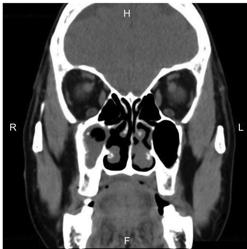
Figure 3: Distribution of the Lund–Mackay score in patients with and without accessory ostia in the superior meatus of bilateral maxillary sinuses

Figure 2: Reconstruction of 3D simulation image to confirm accessory maxillary sinus ostia in superior meatus