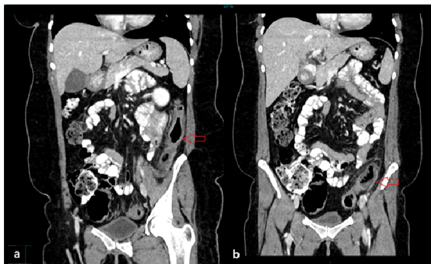
Figure 2: Coronal CT abdomen showing mural thickening and peri-colonic fat stranding in (a) descending colon and (b) sigmoid colon suggestive of ischemic colitis.