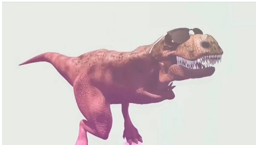
Figure 3: dinosaur