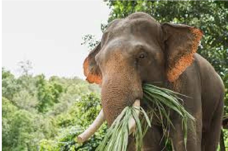
Figure 5: herbivore