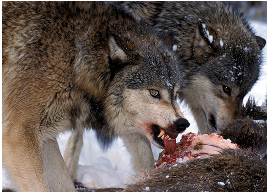
Figure 15: carnivore