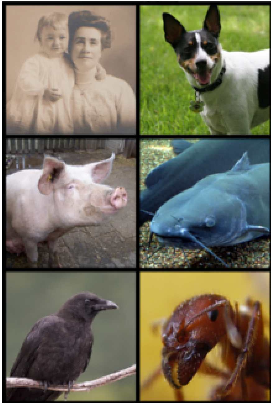
Figure 16: omnivore