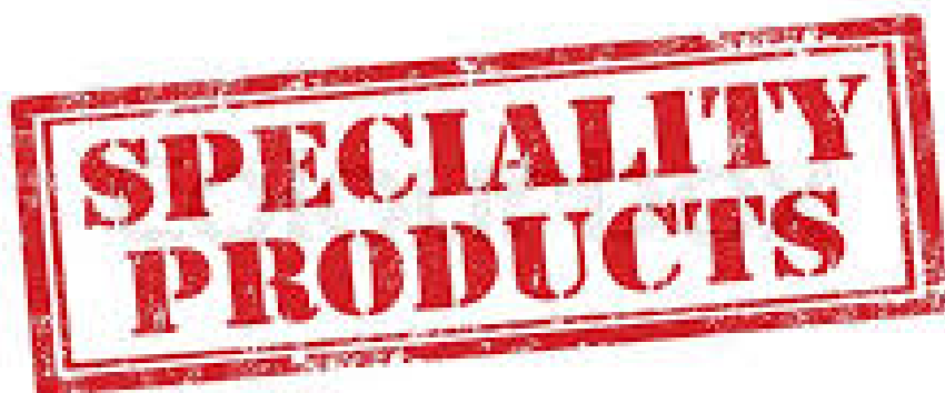
Figure 4: specialty