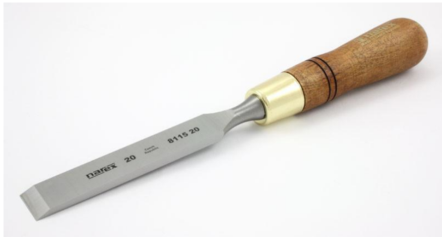
Figure 10: chisel