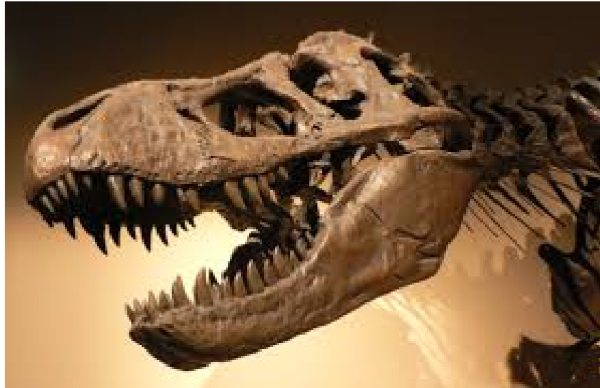
Figure 7: fossils