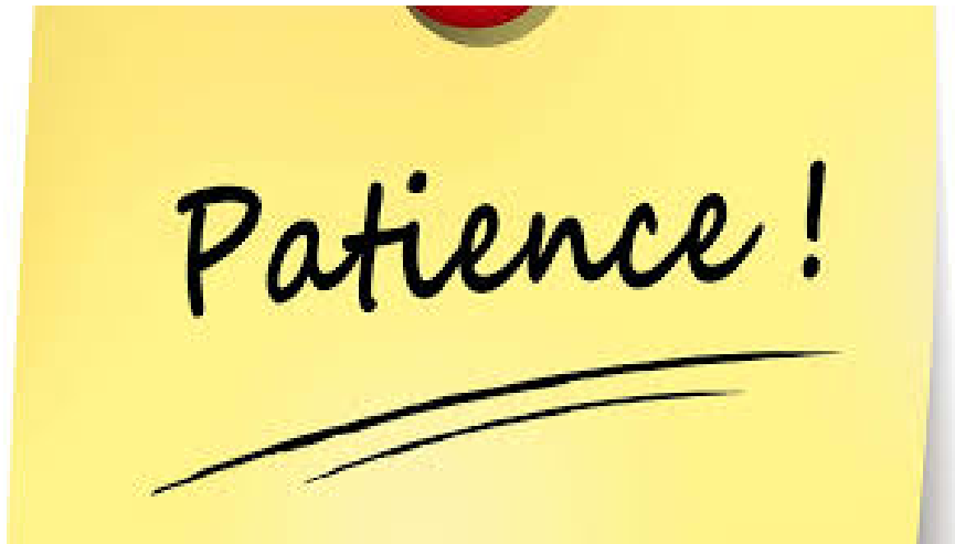
Figure 6: patience