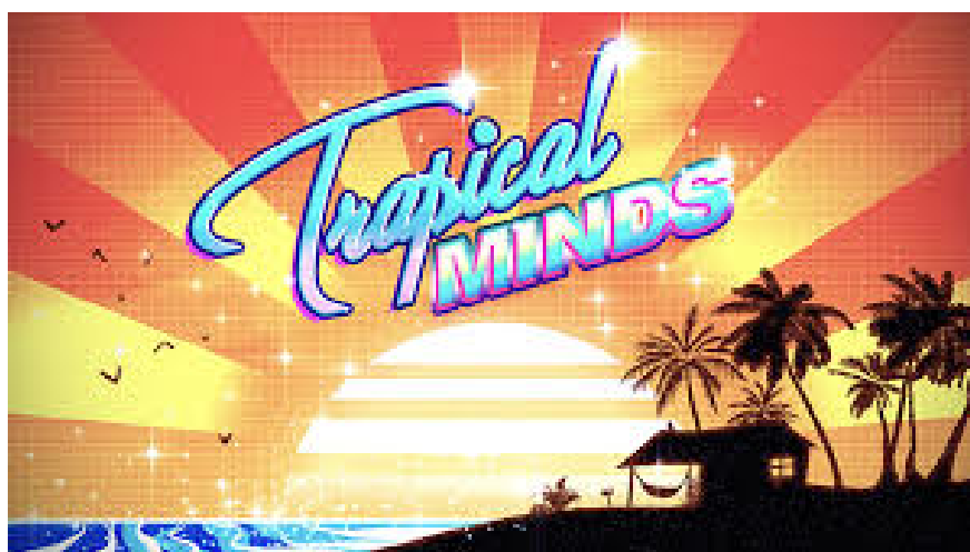
Figure 12: tropical