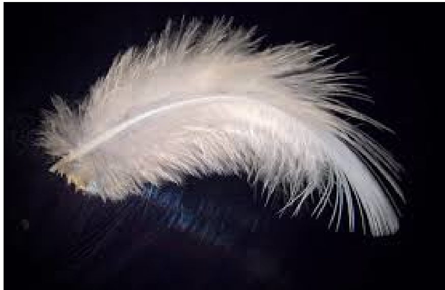
Figure 1: delicate