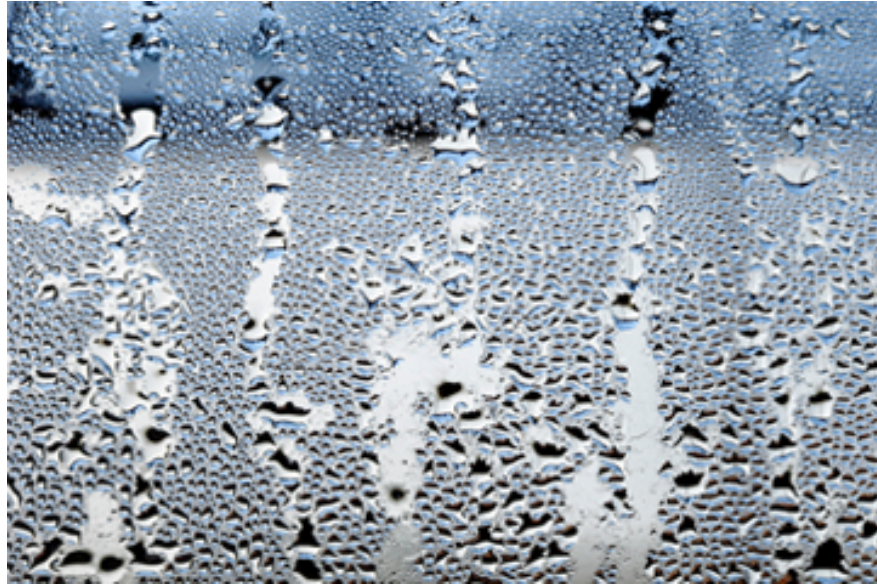
Figure 9: humid