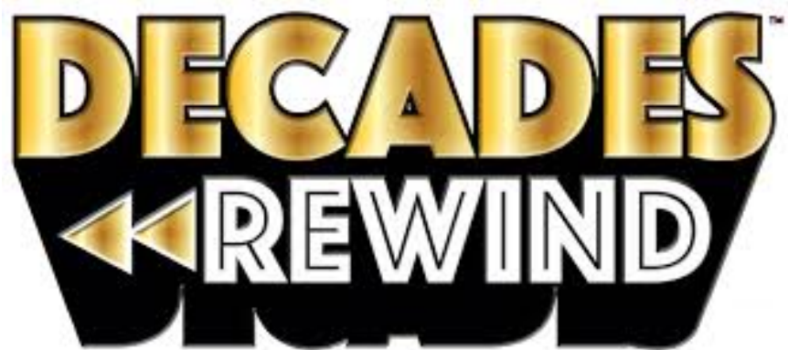
Figure 11: decades