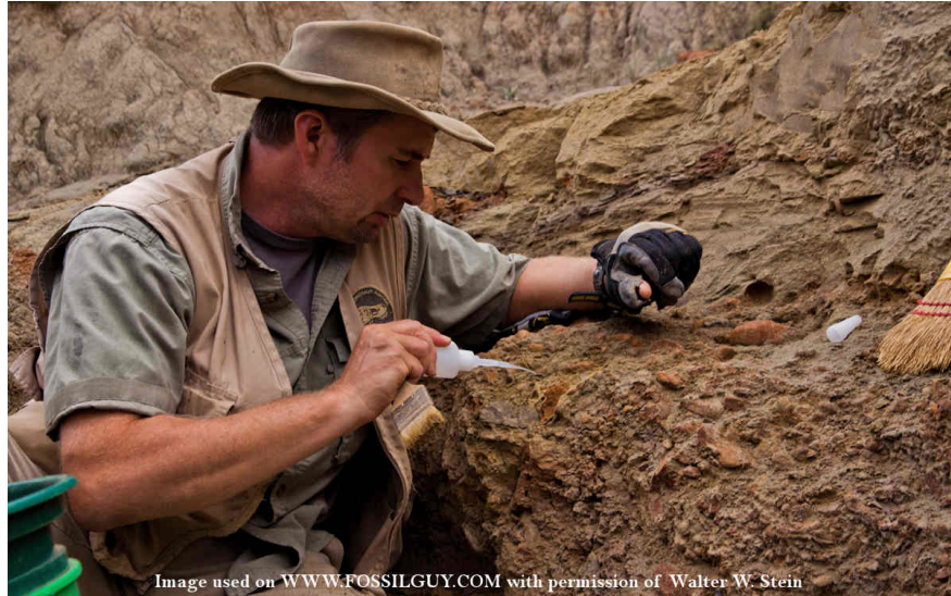
Figure 17: paleontologist