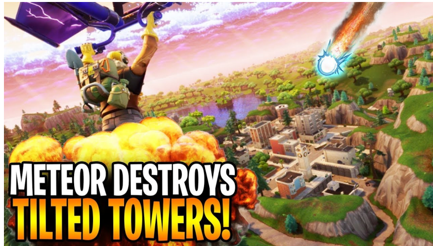
Figure 14: meteor