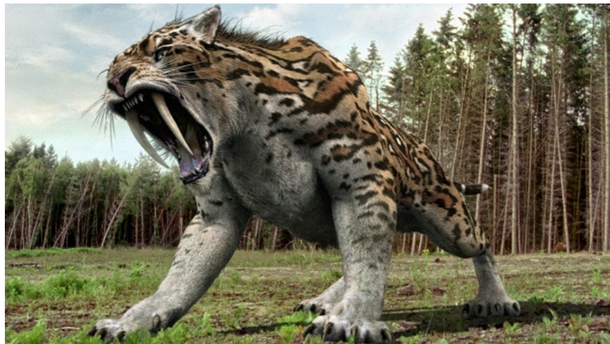
Figure 8: extinct