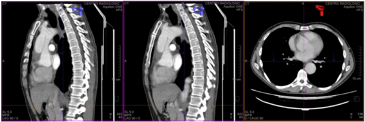
Figure 1. Section of CT scan: A and B shows the aortic root affected by the dissection. C: Transverse section of the aortic root.