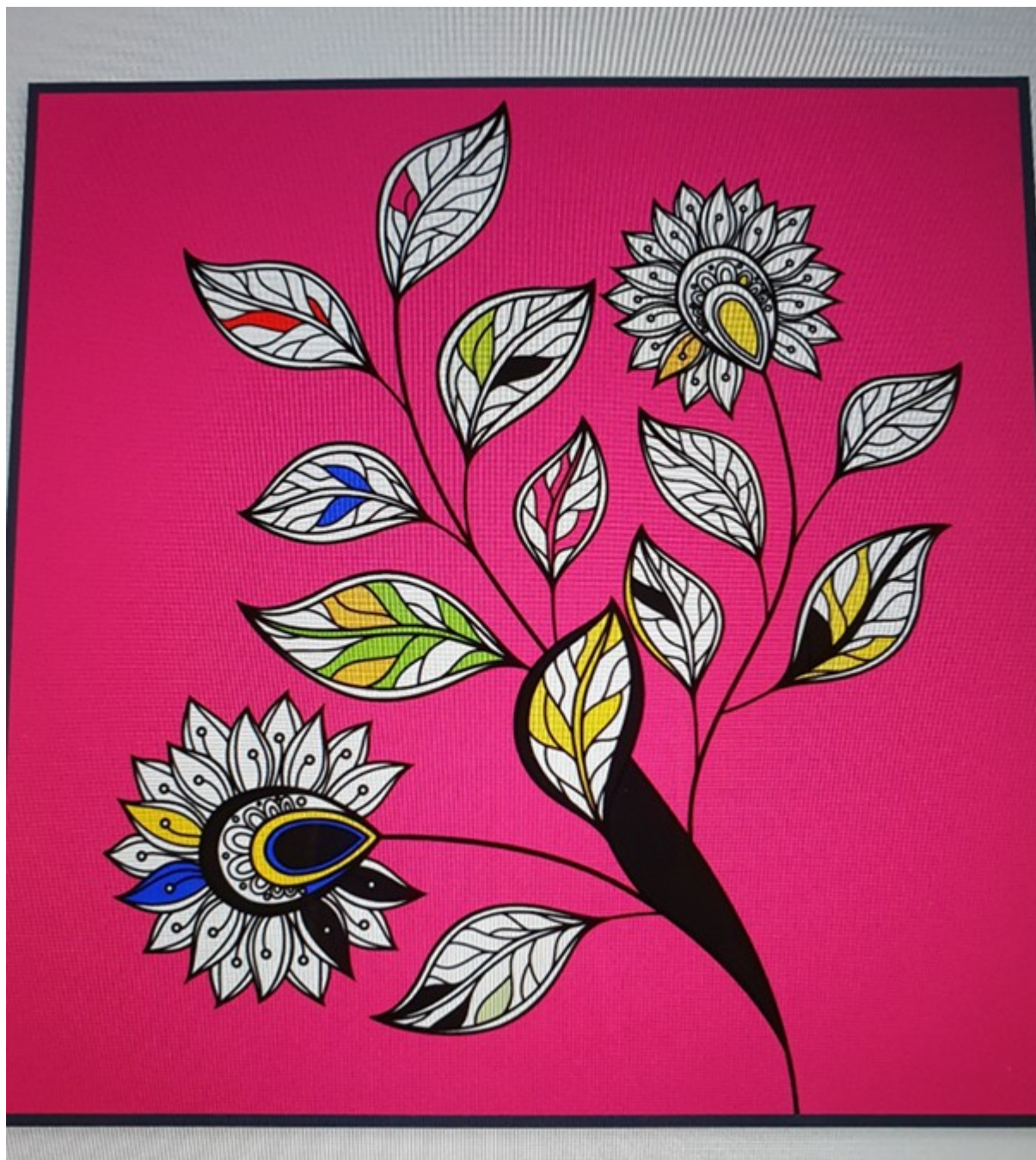
Figure 2. Patient's Attempt With iPad-Guided Colouring.